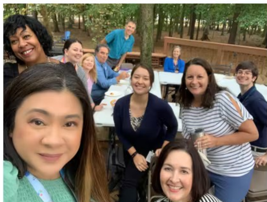
Q4 DFGM: LGBTQ+