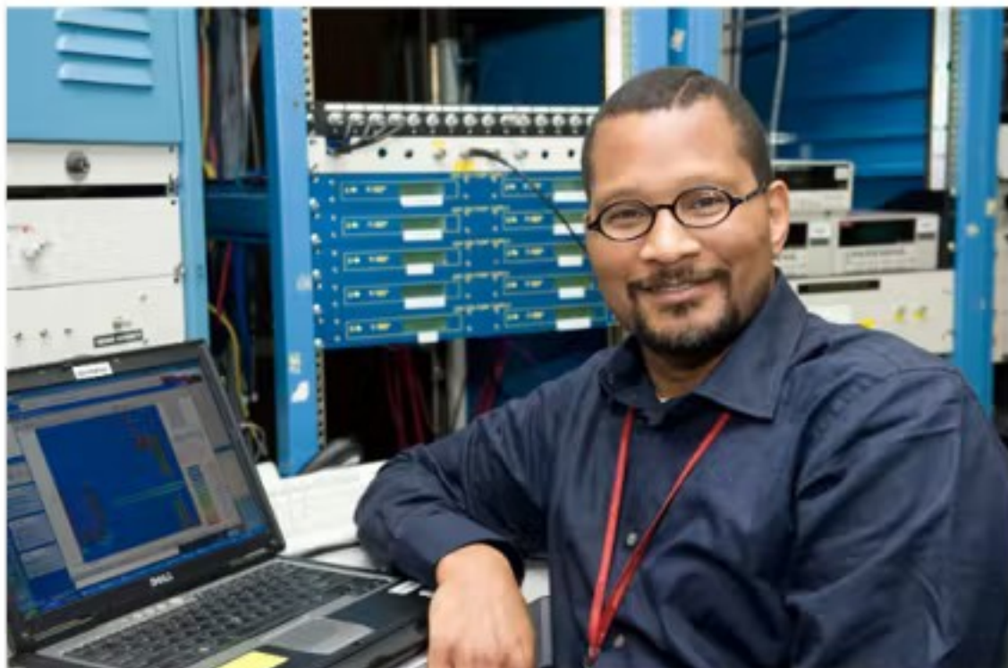
Q4 DFGM: Veterans